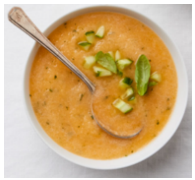
from Forks over Knives